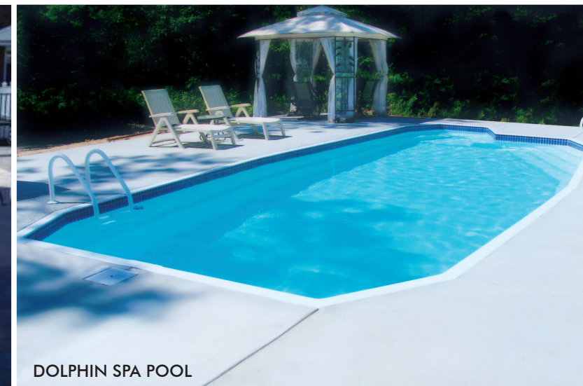
DOLPHIN SPA POOL