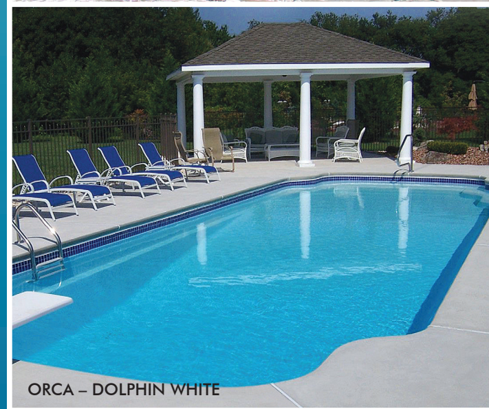
ORCA - DOLPHIN WHITE