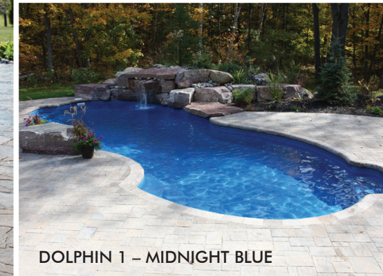
DOLPHIN 1 - MIDNIGHT BLUE