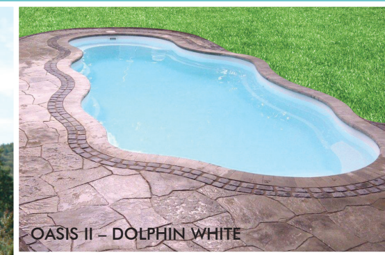
OASIS II - DOLPHIN WHITE