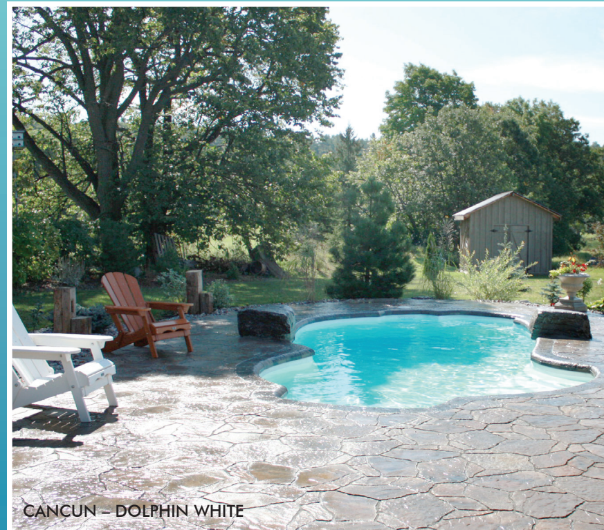
CANCUN - DOLPHIN WHITE